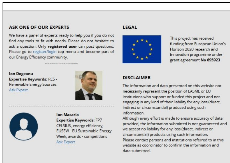
Figure 1. Example of Ask Expert resource entry gate page

In order to ask solution from experts the user has to be registered user .